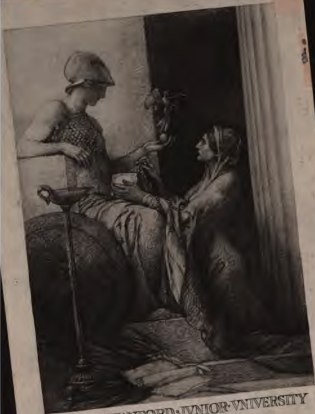
LELAND · STANFORD · JUNIOR · UNIVERSITY